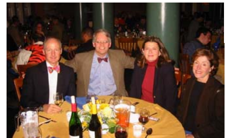
One group of alumni enjoy the fine buffet meal.

Over the coming months, you will receive a number of announcements along with invitations to take part in a variety of events and opportunities. Some will take place in the Club, and some within the Quadrangle community nationwide. And as we look forward to the second centennial for Quad, we will be providing opportunities for you to contribute to the future of Quad as well as enjoy its present.