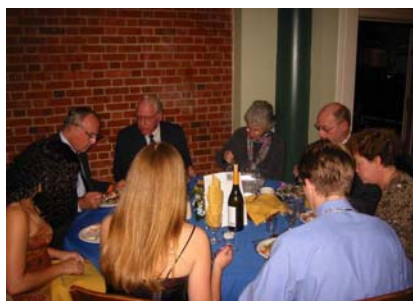
Students and Alumni enjoy the formal dinner's surf 'n turf

Speaking of changes for the better, you may remember that the upstairs Library (also known as the former pool room) was remodeled last year, including beautiful cherry paneling, a new carpet, and new