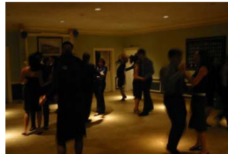
Courageous couples start off the night of dancing