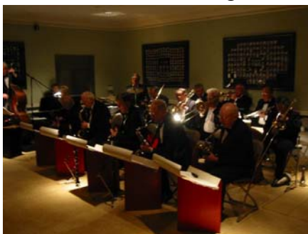
The amazing 14-piece band got our feet stomping

For the moment, the current undergraduates and the current graduate board are considering the proper long-term investments in both facilities and other resources to enhance the "Quadrangle Legacy." We desire more engagement of alumni to guide and assist the undergraduate members. We envision a more effective coordination of Quadrangle alumni to provide networking and assistance (such as our current successful program which gives the undergraduates a forum to learn more about careers in medicine, law, consulting, and alternative jobs). In short, we are focusing on creating a lasting and impactful Quadrangle Community that will continue to contribute to and learn from each member over his or her lifetime.