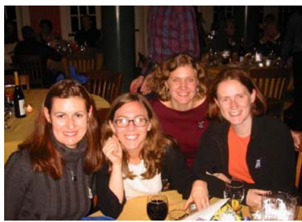
A group of friends reunites at the buffet

You will continue to hear from us over the coming months about some major plans and opportunities. In the meantime, however, we also invite you to consider a donation that will enable us to continue enhancements in preparation for the upcoming membership drive. We believe enhancements such as the redesigned Library and computer room will be just as important in the future to keep the club resourceful and competitive. As such, any immediate contributions would be very helpful and appreciated (not to mention tax deductible for 2002). In addition, any contributions you make between now and the end of our Centennial campaign will be acknowledged in the Founders' Circle membership.