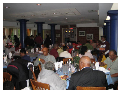
A packed house at Homecoming

Alumni events also continue to be well attended. After the Homecoming football game this past Fall, all three floors of the Club were filled with returning Princetonians, happy to be back