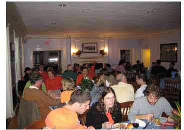
Alumni enjoy the cuisine

As my term as Undergraduate President draws to a close, I am happy to report that Quad is a more vibrant community than ever. Our membership is a tight-knit and diverse cross-section of the University, with student members from a wide range of teams, organizations, and groups. Our junior members are truly excited to be a part of Quad and they have already made the club their home, doing everything here from working and playing in the backyard to relaxing and partying on weekends. In the coming months we will welcome a new class of members who will bring a whole new energy and diversity to the club. Though the faces may change, the spirit will remain, and Quad will always be a place where one can be free to be themselves and feel at home.