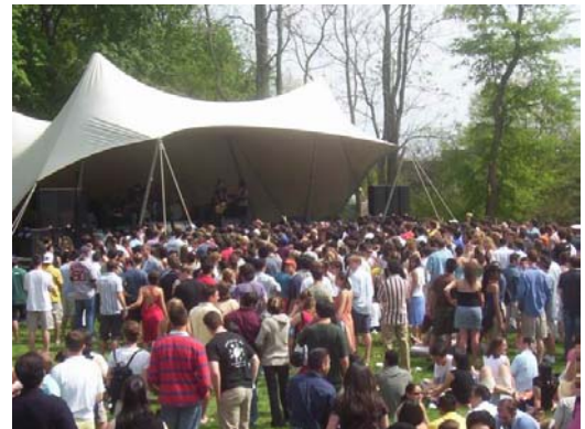
Quad's back lawn during Lawnparties

3pm – 6pm: Quad hosts a free barbeque for the whole family out back in our lovely yard. Stop by and see us!