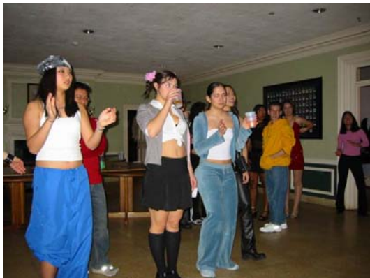
Everybody loves karaoke!

As I mentioned in my last letter, we are now actively soliciting Class Agents for each club section. So far, we've focused on the classes with upcoming major reunions, but soon enough there will be a push to get a representative from each class. This is a great opportunity to get back in touch with clubmates you've drifted away from, and as an added bonus you'll always be "in the loop" on our club events. Let us know if you're interested in being a Class Agent for your class, and a member of our Alumni Relations Committee will be in touch to discuss our goals and the tools we'd be happy to provide you.