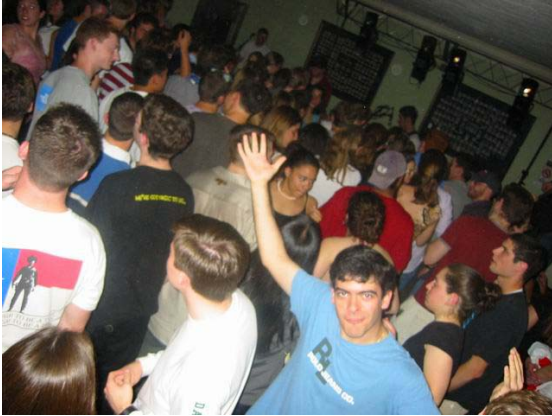
Undergrads dance to a favorite band

But to get us on the road to the future, I'm proud to announce the launching of our new website, which should be available by the time you receive this letter at http://www.quadrangleclub.org . (Thanks must go to a generous alumnus who purchased the domain a few years ago, and donated its use to us all.) This site should stay relatively up-to-date with all the latest alumni events and activities, so feel free to check in as you're planning your next trip back to the area.