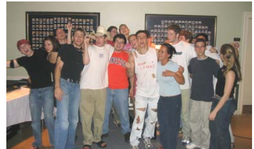
Just another afternoon at the Club...