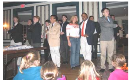
An alumna gets serenaded at Homecoming

Once again, Reunions are just around the corner, from May 27-30 th , 2004. In our continuing efforts to make sure our Alumni know they are welcome back at the club, we will make sure the clubhouse is open throughout the weekend for you and your families to come by and visit. Additionally, we will again be hosting two separate meals for alumni and their families on Saturday May 29 th :