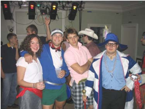
Halloween at the Club brings out the funk

Secondly, here's another reminder about the Quad email list. If you're not already signed up, here's how: head on over to the University sponsored TigerNet site ( http://tigernet.princeton.edu ), sign up for a user login if you haven't done so before, then click on "Discussion Groups" on the left hand navigation bar. Next click on the "Eating Clubs" link, select the "quad-news" group, and select the delivery mode you'd prefer. It's that easy!