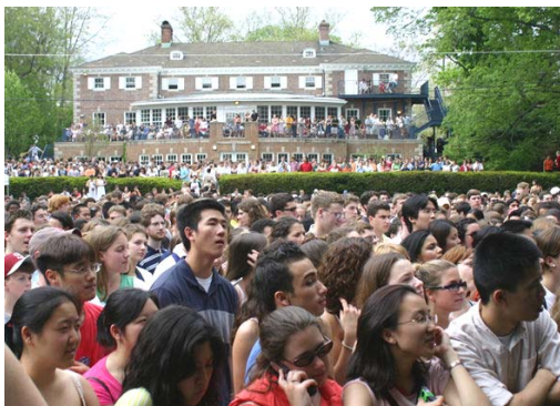
Lawnparties had Quad's lawn jam-packed

Together, we have already taken steps to begin recruiting the next class of members. In April, Quad hosted an outdoor BBQ band event, giving each member passes to bring guests. This event really showed off Quad’s amazing backyard and promoted the club to those who attended, giving them an opportunity to see Quad on a non-party night. By showing the intimacy of a “members and guests only” event, we impressed many of the guests, and expect many of them to sign into Quad next winter.