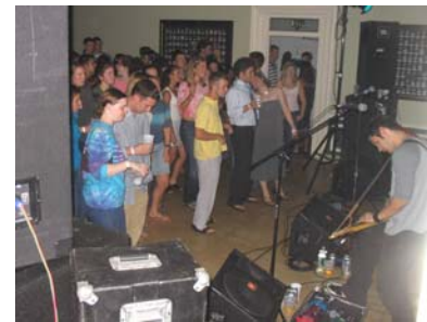
A crowd gathers to hear the night's entertainment

If you are ever in the area, please drop by and say hello. I would love to tell you more about the exciting things going on here. I'd also love to hear some stories of years before, stories of how you and your fellow Quad members used to have fun in your time here. Please know that you are always welcome back to your club, and that the undergraduates and I look forward to your visits.