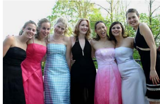
Friendships are formed at Quad that will stay with us throughout the years...